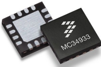
16-PIN UQFN 98ASA00110D

Expanding on more than 30 years of innovation, Freescale is a leading provider of high-performance products that use SMARTMOS technology combining digital, power and standard analog functions. Freescale supplies analog and power management ICs that are advancing the automotive, consumer, industrial and networking markets. Analog solutions interface with real-world signals to control and drive for complete embedded systems.