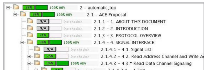
Figure 4: An ACE vPlan maps the necessary coverage and checks directly to the ACE specification

Both the vPlan and the compliance test suite are organized modularly. This enables parts of the specification not in use to be excluded, allowing you to focus on the greatest risk areas.